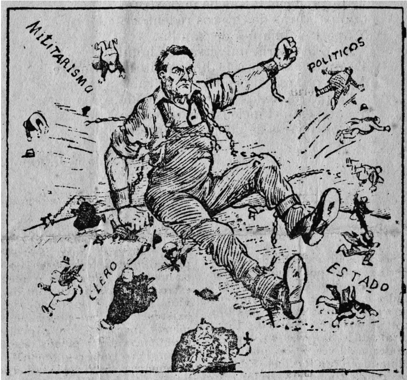
Fig. 7. Peruvian anarcho-syndicalism: breaking the bonds of oppression, exploitation, and ignorance.